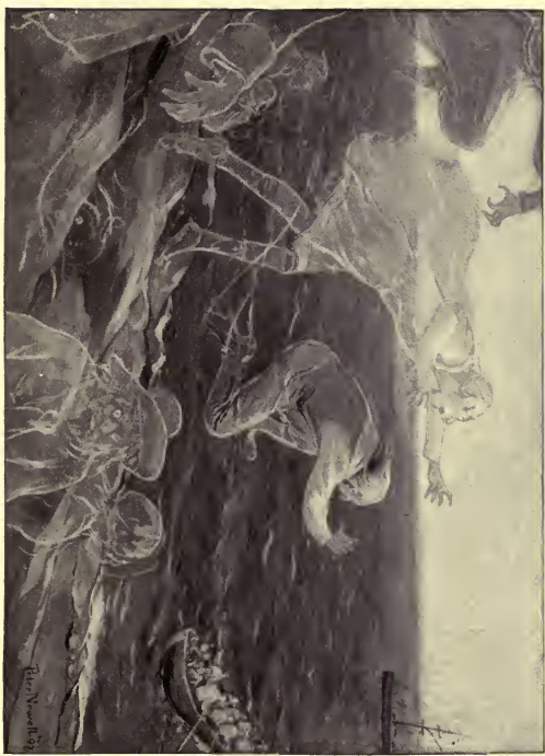
“THE PIRATES MADE A MAD DASH DOWN THE ROUGH, ROCKY HILL-SIDE”